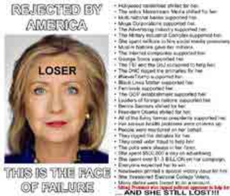
Figure 1: Anti-Hillary Meme posted on Daily Stormer, 3/6/17

macro in Figure 1). The milder images are intended to work as “gateway drugs” to the more extreme elements of alt-right ideology.