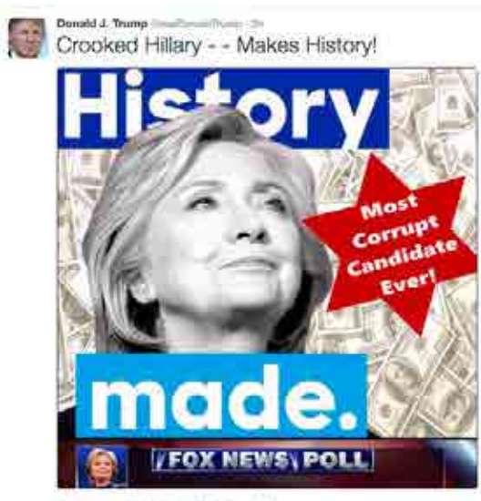
Figure 3: Hillary Clinton Meme Tweeted by Donald Trump

On July 2, 2016, Donald Trump tweeted an image of Hillary Clinton next to a Star of David graphic labeling her the “Most Corrupt Candidate Ever!” (Figure 3). 235 The image’s background consisted of piles of U.S. currency. The combination of the Star of David, the money, and the suggestion of corruption evoked stereotypical ideas about Jewish people and referenced conspiracy theories about Jewish control of monetary systems. 236 National media outlets immediately noticed the image’s anti-Semitic references and published critical responses or stories highlighting the social media backlash. 237