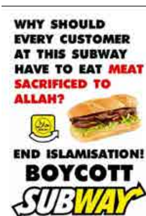
Figure 2: Anti-Islamic Meme posted on Daily Stormer, 3/6/17

The alt-right has also been successful at creating memes that do not involve images. For instance, the (((echo))) meme surrounds the names of Jewish people with parentheses. The meme originated in a browser extension that appended Jewish names with such parentheses; users often manually add echo parentheses to posts in far-right online spaces. The goal is to demonstrate the extent to which Jewish people are present in elite circles and upper echelons of media by drawing attention to how frequently they are mentioned in the press.