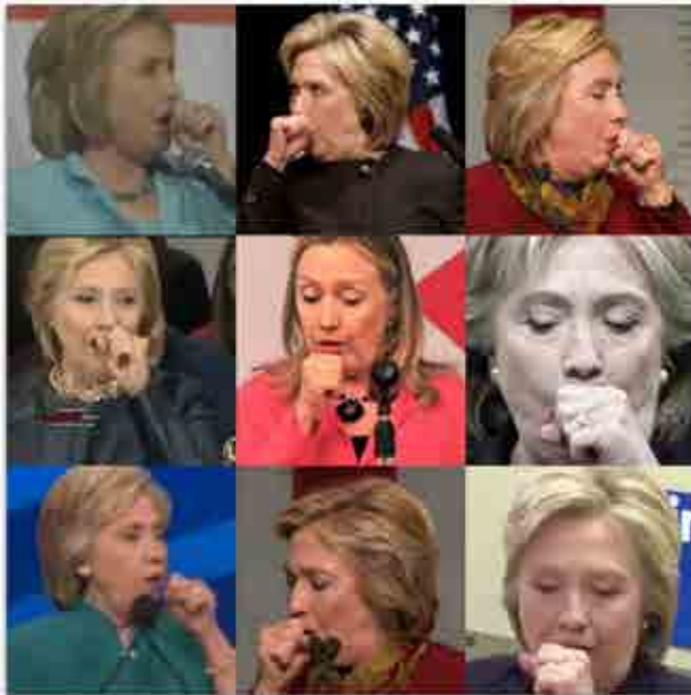
Figure 4: Hillary's Health Photo Collage

the same, reframing facts and posing open-ended questions in ways that seeded doubts among readers and viewers.